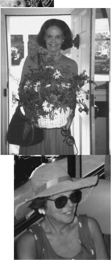
Selby Ehrlich, 1990